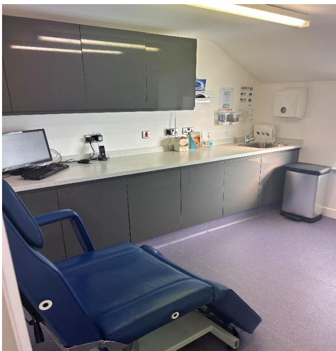
3d Digital Scanner